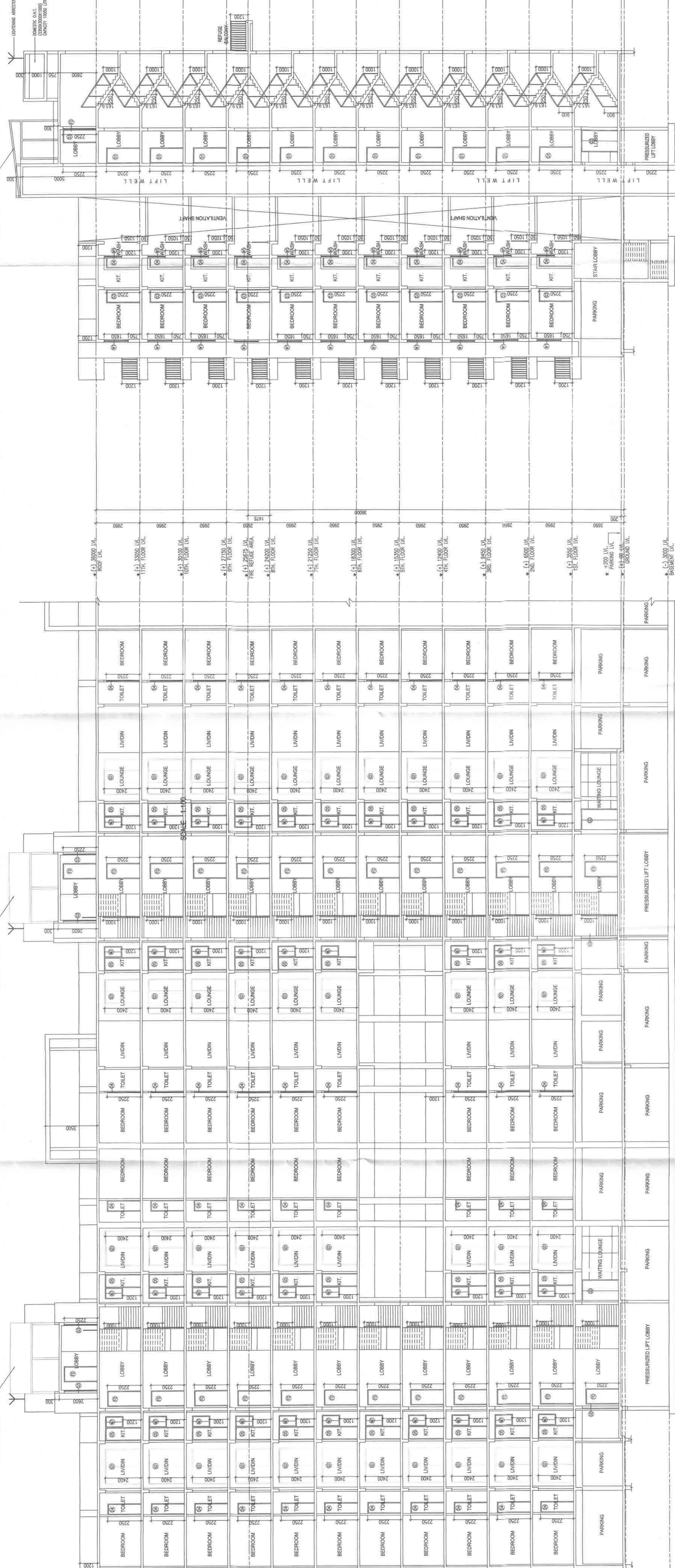
SECTION 04-04 SCALE : 1:100

INDIAN CRAFT VILLAGE TRUST RESIDENTIAL ZONE - BLOCK B SECTION 03-03 & SECTION 04-04